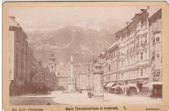
Maria Theresienstrasse in Innsbruck. 7. Innsbruck.