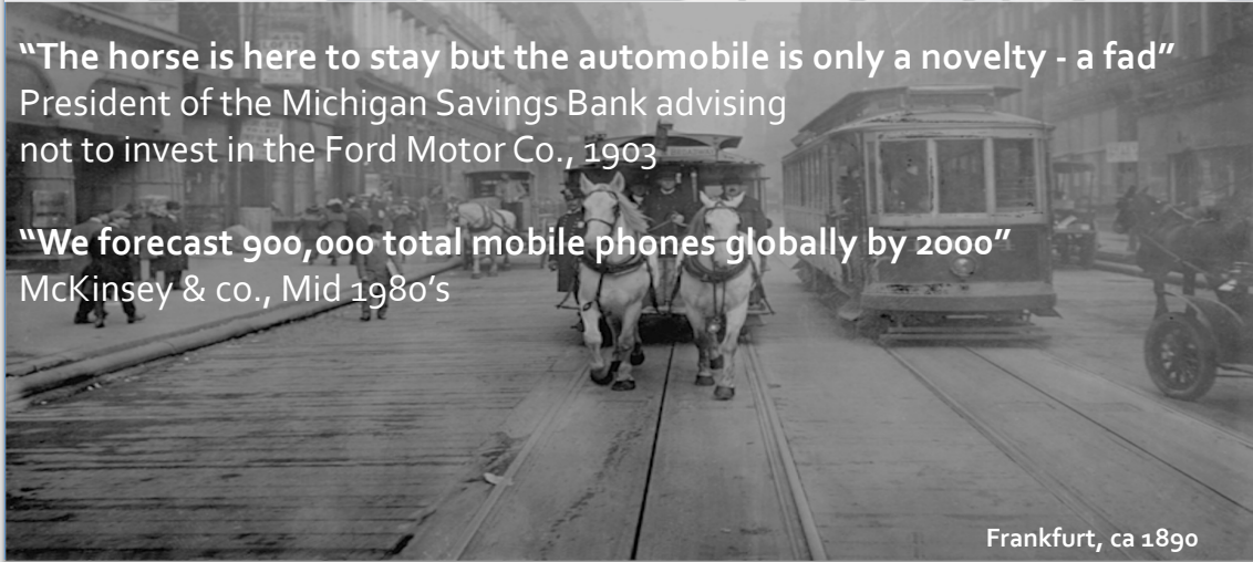
Frankfurt, ca 1890

“We forecast 900,000 total mobile phones globally by 2000” McKinsey & co., Mid 1980's