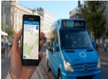
Flexible scheduling & on-demand transit

As consumer habits change and technology allows innovative services, the role of the public sector is also adapting and partnering to enable, facilitate, or restrict some of the emerging mobility business models