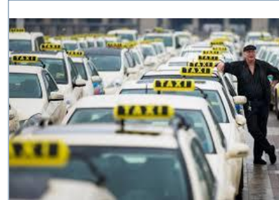
New Regulations for Mobility services