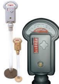
Parking Supply & Monetisation