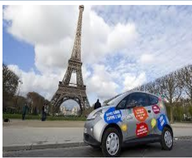
Carsharing Tenders, Operations, SLA's